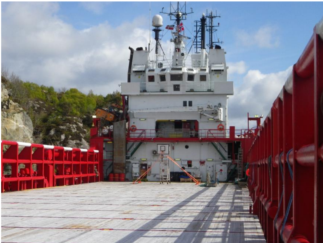
Deck house from aft